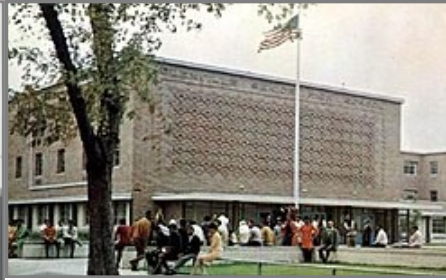
BY WAY OF GLENVILLE HS CLEVELAND 44108