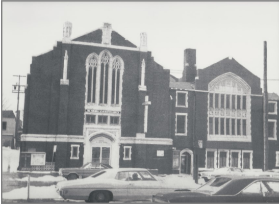
FROM: 650 PARKWOOD DRIVE CLEVELAND 44108