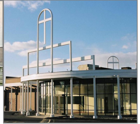
TO: 10250 SHAKER BLVD CLEVELAND 44104